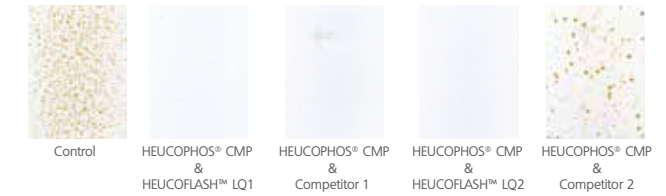
Flash rust after drying at RT / SBS

Without flash rust inhibitor it shows the typical rust spots that are migrating to the surface while the resin is gelling and curing.