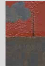
Comp. zinc phosphate