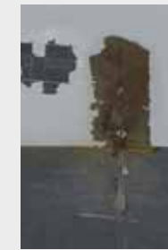
Comp. zinc phosphate