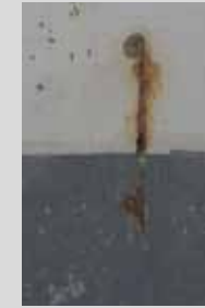
Comp. zinc phosphate